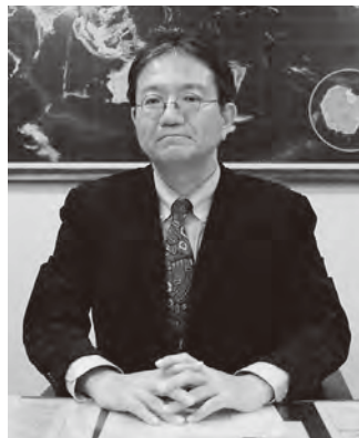
Coordinator of the BRIT XII

Professor, Slavic Research Center, Hokkaido University, Japan Project Leader of Global COE program “Reshaping Japan’s Border Studies”