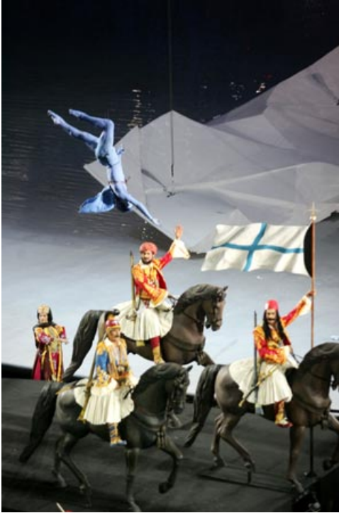
Greek Mythology and Modern Greek Heroes Opening Ceremony of the Olympic Games, Athens 2004