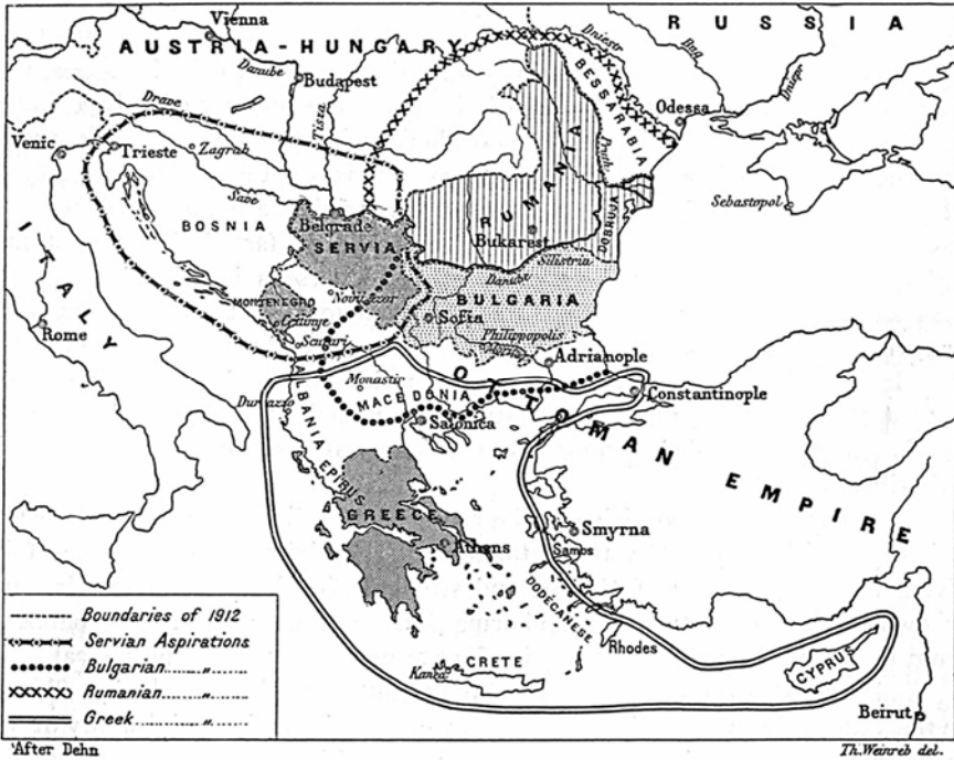
‘After Dehn Competing Balkan Nationalisms 2