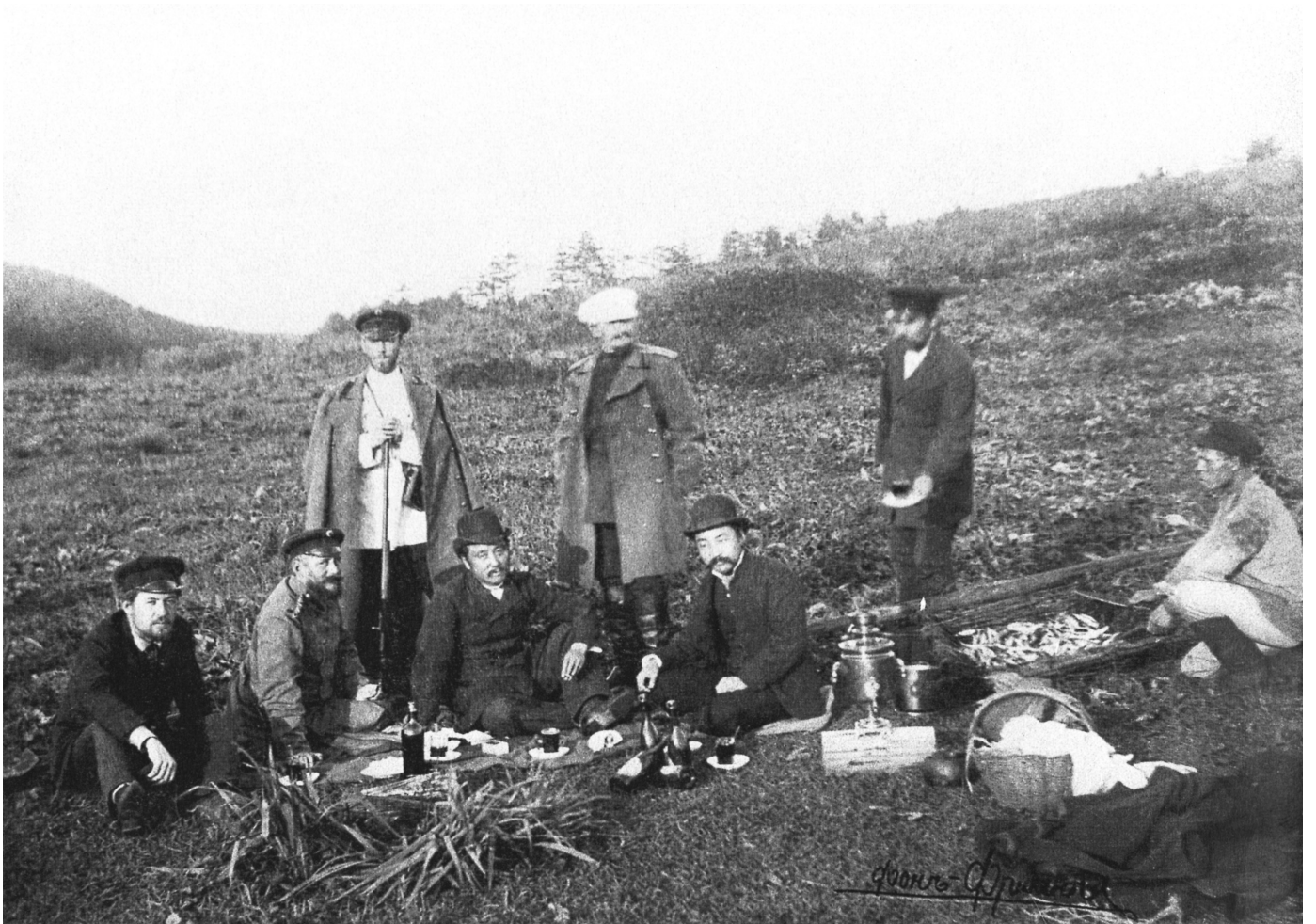
Chekhov visits the Japanese consul. Korsakovsky, 1890.