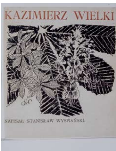
Illust. 20. Stanisław Wyspiański, book cover for the artist's play Kazimierz Wielki (Casimir the Great), with a motif of a chestnut flower, 1900

Innsbruck, 65 which made special iridescent glass and later, he spent two weeks in the town, supervising the making of stained glass for the Franciscans. During World War II, the glass was dismantled and reassembled afterwards.