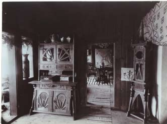
Illust. 15. The Podhale Arts Society exhibition rooms