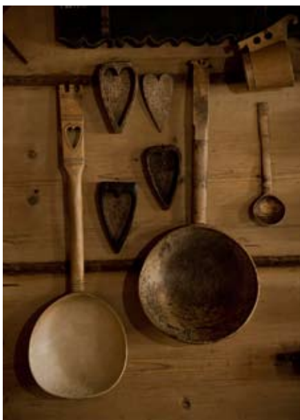
Illust. 4. A set of old wooden spoons, cheese moulds, and a wooden ladle with a characteristic handle in the same collection as Illust. 3

the first collections of highlanders' costumes and domestic objects, such as intricately carved wooden spoon holders, cheese moulds, pieces of embroidered clothing, and metalwork brooches, frequently saving from destruction unique eighteenth-century items (Illust. 3 and 4). In Lviv, Dembowski's collection was on loan in the ethnographic section. 38 The collection was also meant to provide models for domestic crafts and Dembowska herself designed a hanging inspired by broad forms of folk