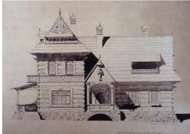
Illust. 1. Stanisław Witkiewicz, drawing of Koliba, 1892

This paper sets out to put some hitherto separate threads in the history of Polish crafts around 1900 together, and it is a first attempt to highlight the bearing of the early collections of historical handicrafts in manor museums on the zeal for collecting ethnographic objects, which resulted in the subsequent creation of styl swojski in interior furnishings and architecture. Passionate interest in history and serious historical studies also underpinned