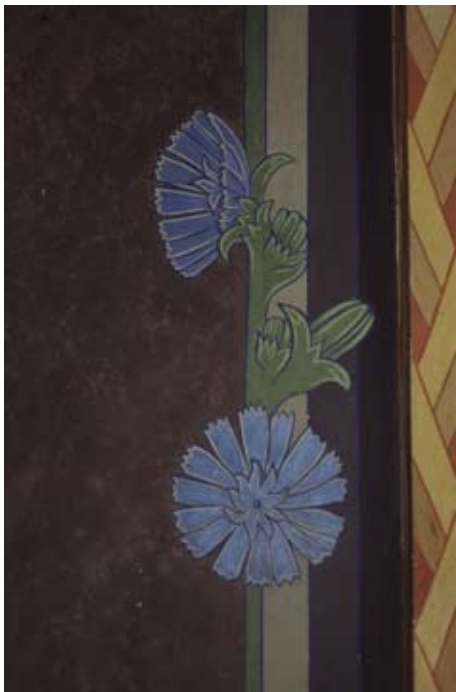
Illust. 19. Stanisław Wyspiański, detail of a wall painting with a chicory flower in the chancel of the Franciscan Church in Cracow, 1897–1904