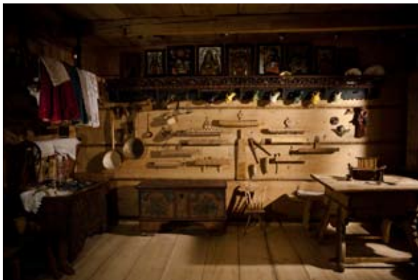
Illust. 3. Dembowski's ethnographic collection reconstructed in the Gąsienica-Sobczak Museum in Zakopane