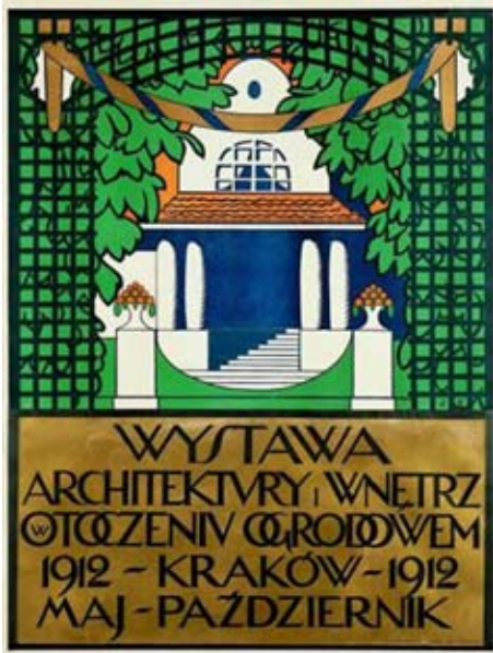
Illust. 2. Poster advertising the Exhibition of Architecture and Interiors in Garden Settings, organized by the Polish Applied Arts Society in Cracow in 1912

the work of Stanisław Wyspiański, one of the most outstanding representatives of Polish modernism and a moving force behind the foundations of the Polish