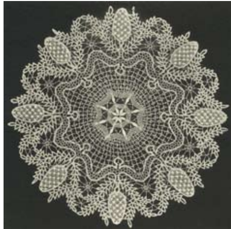
Illust. 13. Karol Kłosowski, lacework (photograph from the exhibition in Paris, 1925)