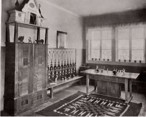
Illust. 21. Edward Bartłomiejczyk, children's room in the Exhibition of Architecture and Interiors in Garden Settings, Cracow 1912

to the new ideals of modernity with its claims to space and light. The revival of crafts had by then become an assimilated experience and the rooms, designed by individual artists, were furnished with pieces of often simplified design and made generous use of handwoven kilims and carpets, hanging on the walls and lining the floors ( Illust. 21 ). Though evocative of the homes of the Polish gentry and nobility of the past, whose walls were richly lined with hangings, the modern design of the textiles in the Cracow exhibition, no less