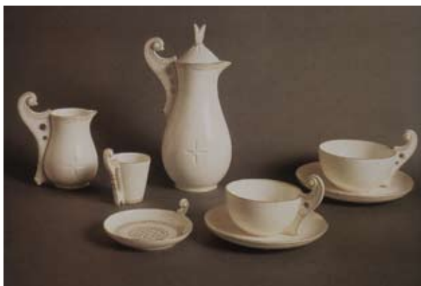
Illust. 7. Stanisław Witkiewicz, tea set

Witkiewicz’s rich knowledge of repertory forms and decorative motifs, characteristic of the folk arts in the Tatras and Podhale region, was a result of his collaboration with Władysław Matlakowski, the author of two monumental volumes, Budownictwo ludowe na Podhalu (Vernacular building in Podhale) and Zdobienie i sprzęt ludu polskiego na Podhalu (Decorations and domestic utensils of Polish people in Podhale), published respectively in 1892 45 and 1901 (Illust. 8). Matlakowski (1850–1895) was a distinguished surgeon from Warsaw, who modernized Warsaw hospital wards and introduced Joseph Lister’s antiseptic method into hospital practice, and was very well-read and traveled. 46