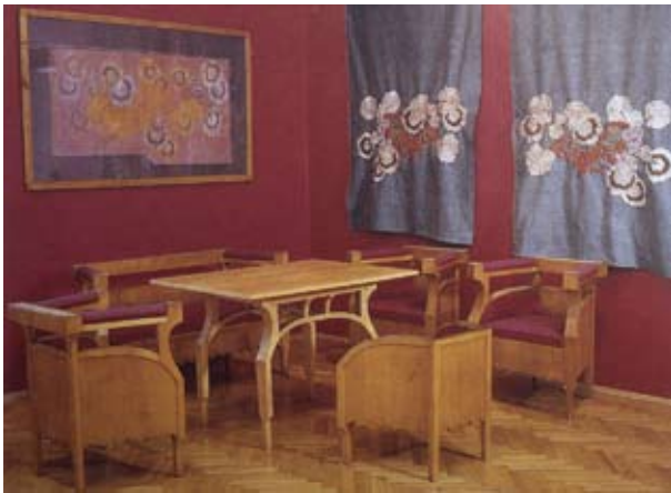
Illust. 18. Stanisław Wypiański, living room of Zofia and Tadeusz Żeleński reconstructed in Wypiański Museum, Cracow

There is a continuity of approaches between the Bride's Room in Lviv and the Żeleńskis' apartment in Cracow ( Illust. 18 ), as both were furnished with hand-