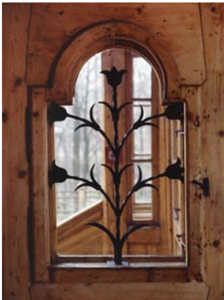
Illust. 6. Stanisław Witkiewicz, stylized lily in the window, Koliba

himself was responsible for the design of the decorative motifs and most of the furnishings, including the curtains with an embroidered pattern derived from woolen trousers worn by highlanders, the doors and windows, with characteristic joints in the framing and a motif of sun rays, the iron gratings in the windows, and the wood carvings with stylized lily flowers (Illust. 6). In the Arts and Crafts manner, he designed some minutiae of the decoration, such as the ornamental hinges of the shelves or a coffee set, whose handles were modeled on wooden ladles used by shepherds (Illust. 7). The set was made of porcelain in Sevres and was known as “Le Style Polonaise,” and another version of it in engraved silver was made by a Cracow jeweler, Wojciechowski. 44