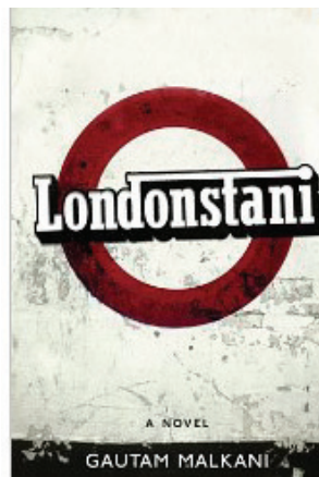
Hardcover edition in the USA