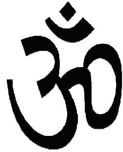
Om Sacred syllable in the Indian religions