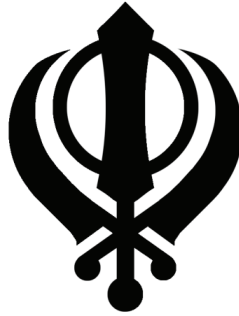
Khanda Important symbols of Sikhism