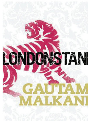
Hardcover edition in the UK