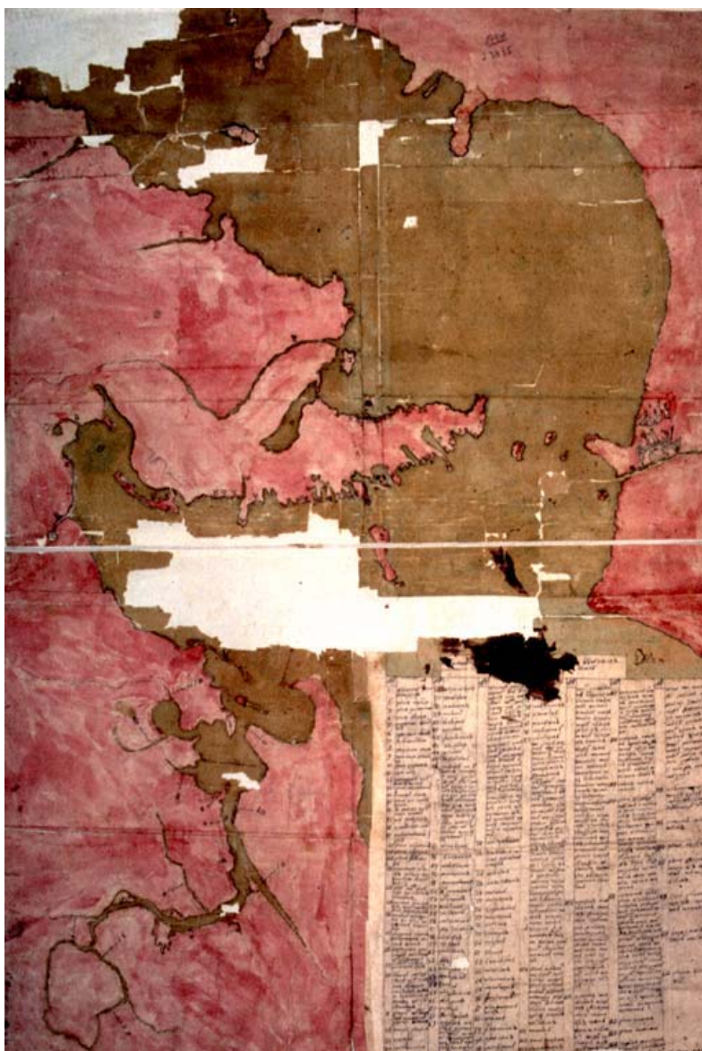
Figure 32. Daurkin's Drawing

Despite its crude appearance due to Daurkin's use of traditional methods of Old Russian cartography, contemporary scholars, especially ethnographers (both Russian and American), rate it highly. According to Professor Dorothy Ray, Daurkin's map was only the second one to repre-