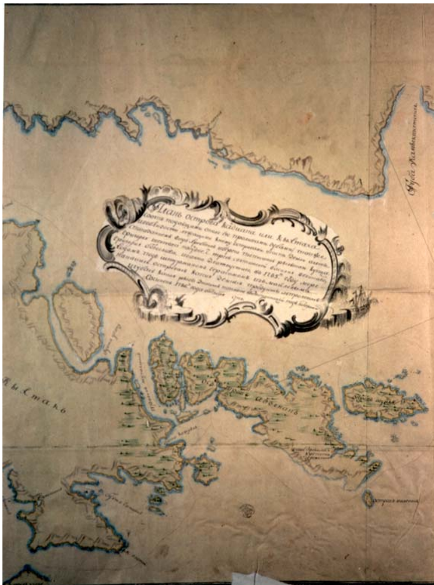
Figure 33. Map of Kodiak Island

Siberian navigation schools (the first one opened in Okhotsk Town under Bering's order). Two more government expeditions were organized by Catherine II's decrees in 1768-69, under the aforementioned Petr Krenitsyn and Mikhail Levashov, and in 1785-95, led by I.I. Billings and G.A. Sarychev. These expeditions surveyed in detail the southern coast of the Alaskan Peninsula and the whole Aleutian Islands, using materials of promyshlenniki's hunting trips and with the participation of experienced navigators, many of whom would also take part in future expeditions. In their